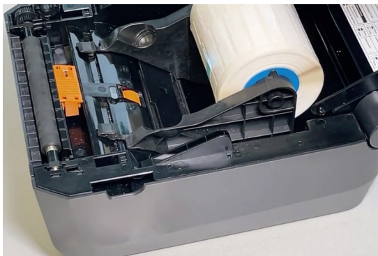
Img.3: eXtra4 reel core adapter in installed condition.