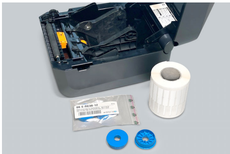
Img.1: New from eXtra4 Labelling Systems: Reel core adapters to improve printing precision of thermal transfer printers.