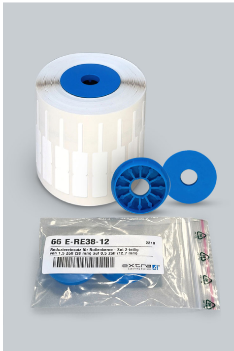
Img.4: Reel core adapters for 1.5" reel cores with reduction to 0.5" roll holder in printer