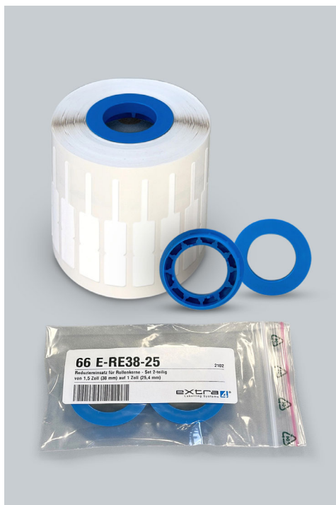
Imb.5: Reel core adapters for 1.5" reel cores with reduction to 1.0" roll holder in printer