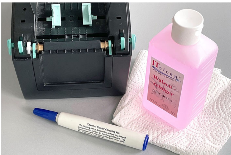
Fig.3: Cleaning and care products for thermal transfer label printers from eXtra4 Labelling Systems