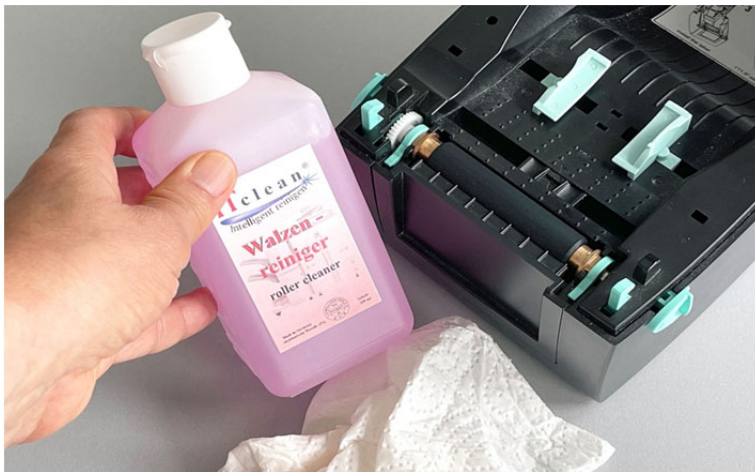
Fig.2: Youtube video instruction on the correct use of eXtra4 roller cleaner with thermal transfer printers